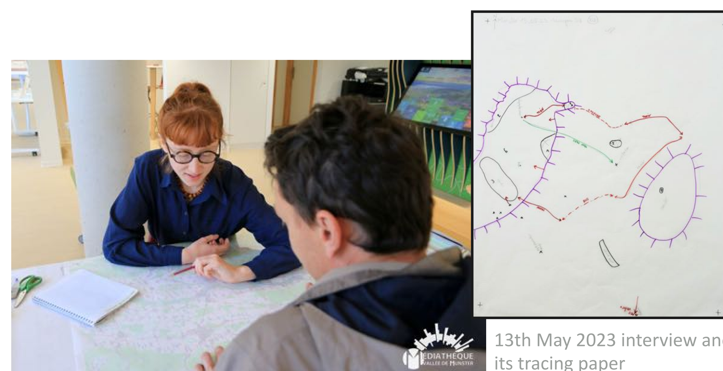
13th May 2023 interview and its tracing paper Médiathèque de la Vallée de Munster